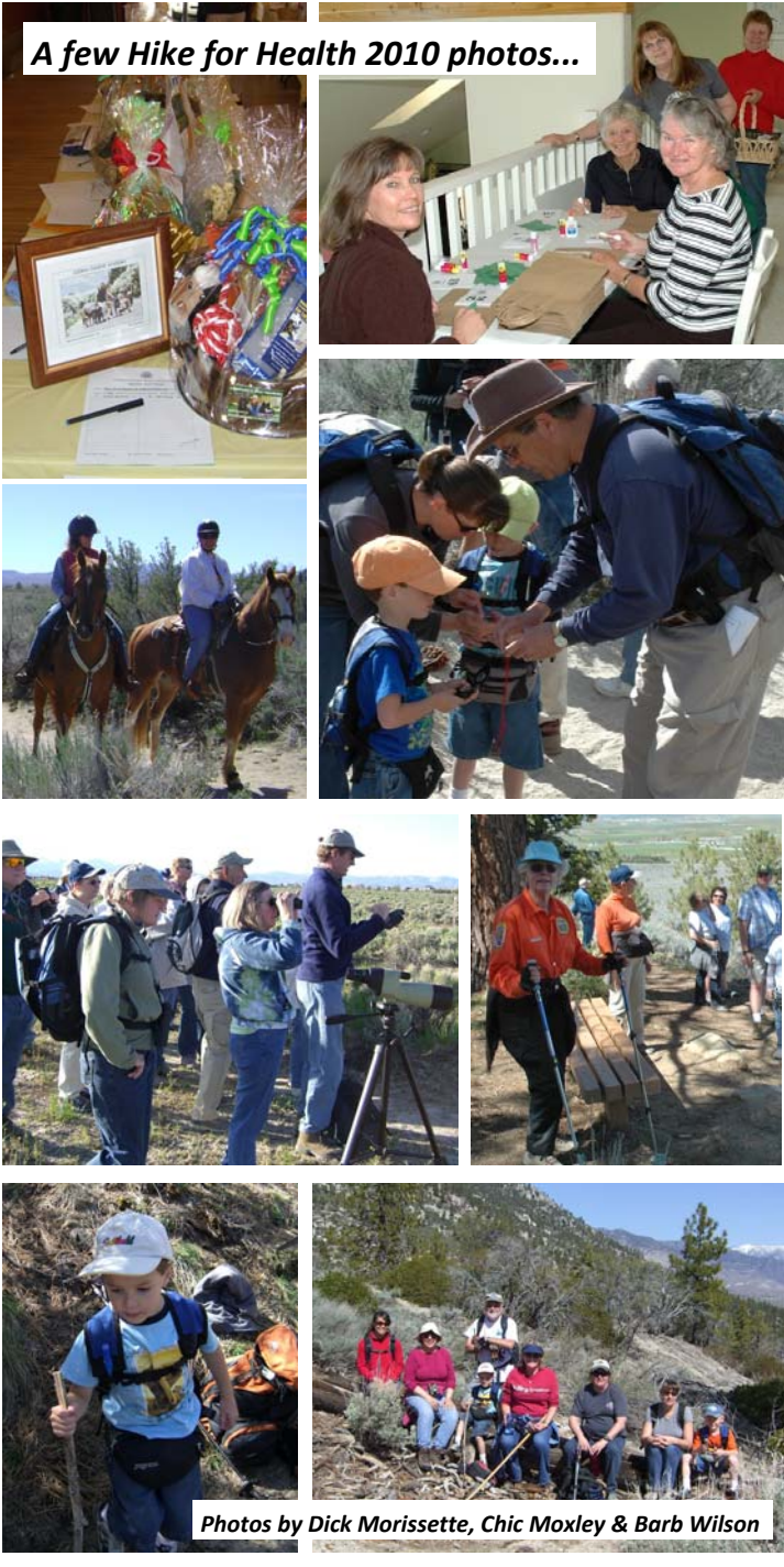
A few Hike for Health 2010 photos...