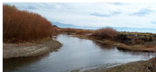
East Carson & West Carson meet at River Fork Ranch