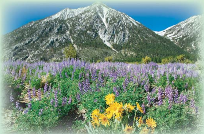
Field of Lupine at Jobs Peak Ranch Trailhead